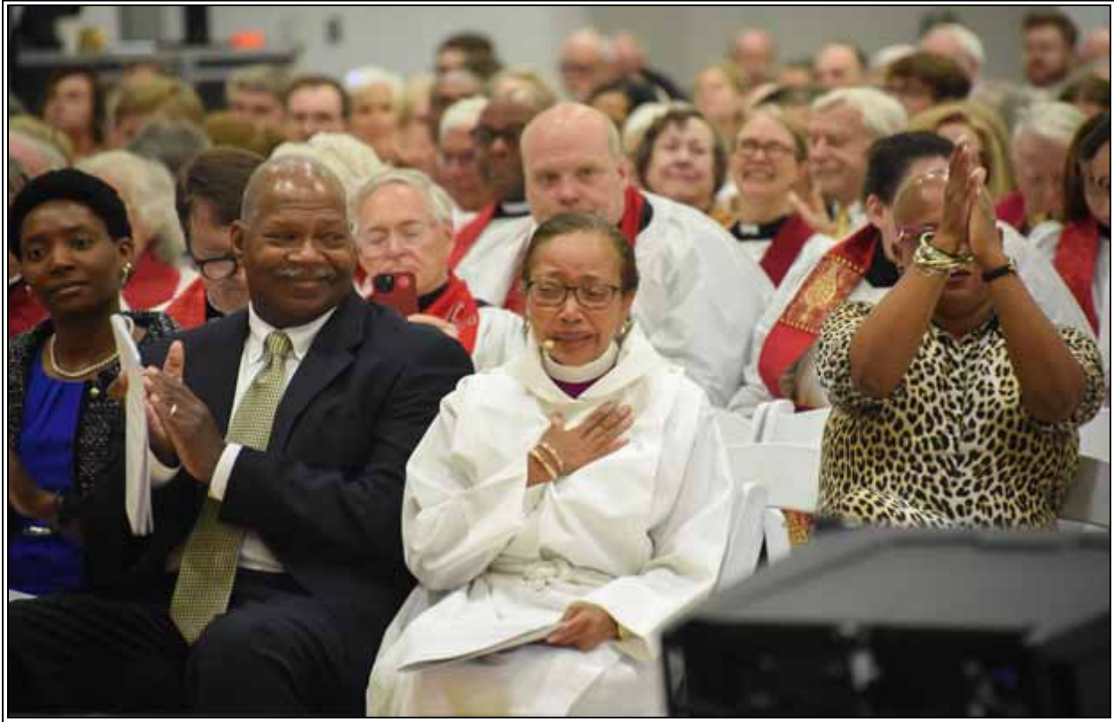
An enthusiastic congregation shares in the excitement and emotions of the historic day